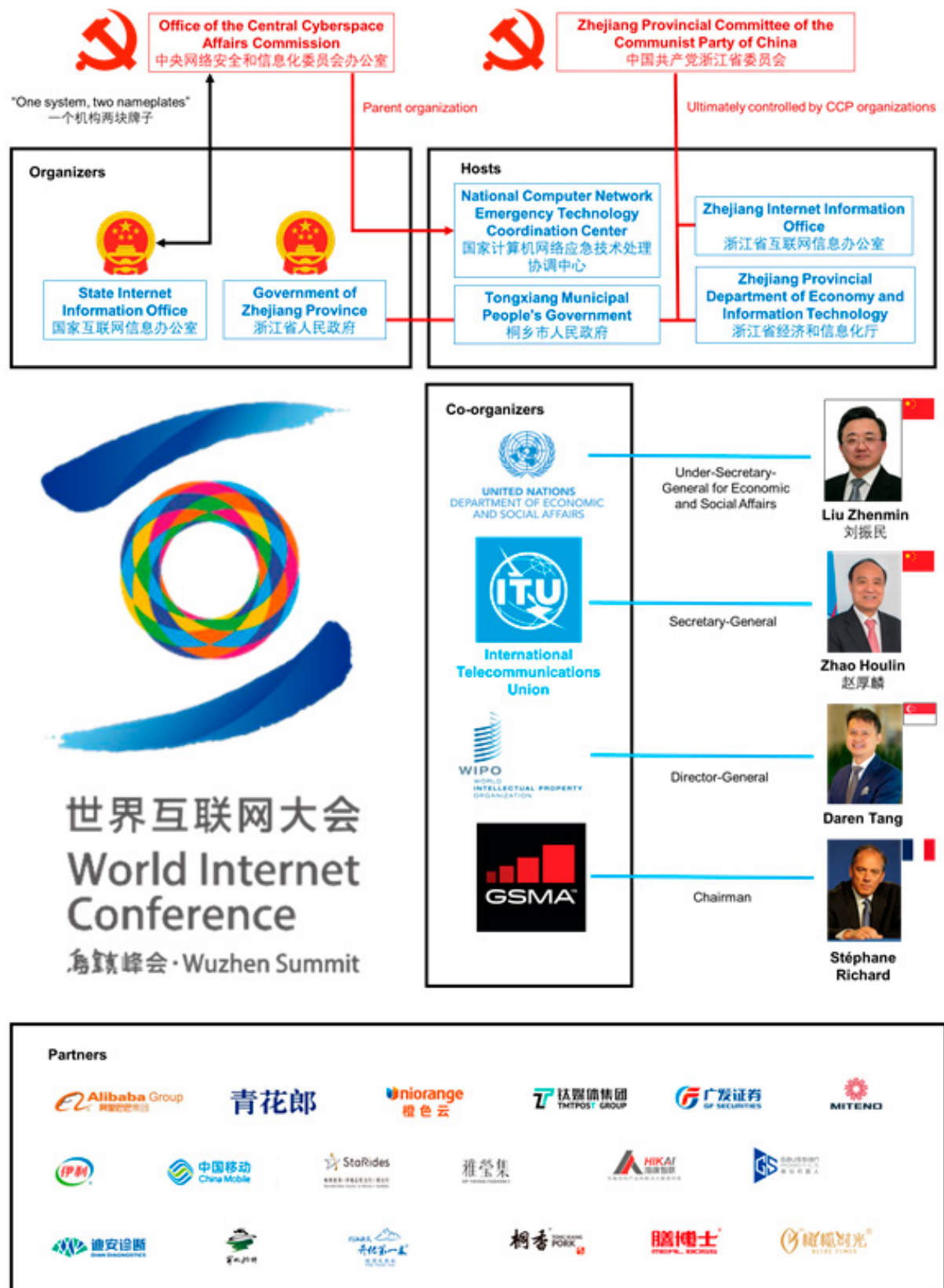
Figure 2: Organisation of the World Internet Conference and its partners