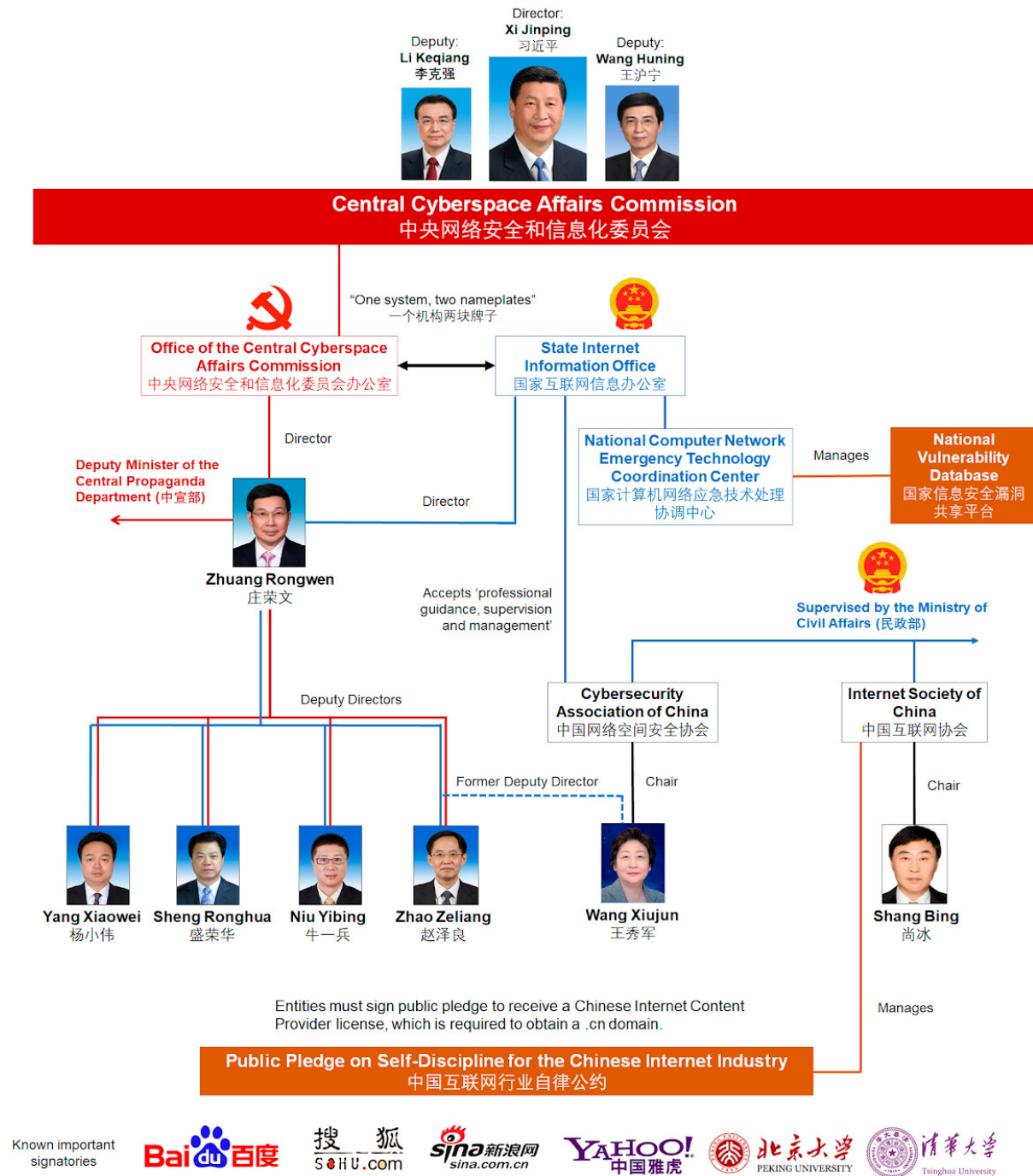
Figure 1: China's cyber policy system